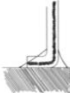
WRONG! Fig. 2